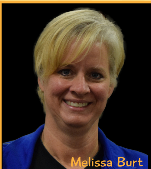
Commons Wellness Coordinator

Hopedale Commons has been Central Illinois' premier choice for Independent and Assisted Living for 21 years!